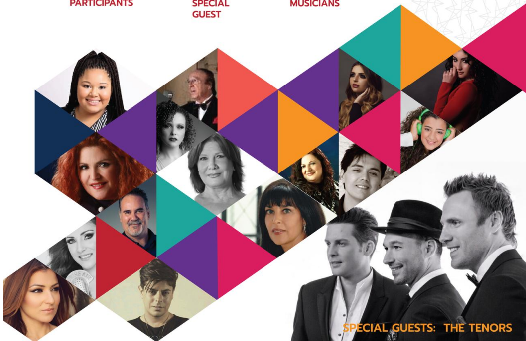
SPECIAL GUESTS: THE TENORS

https://www.flickr.com/photos/eu2017mt/35437251811/ https://www.flickr.com/photos/eu2017mt/35437258631/